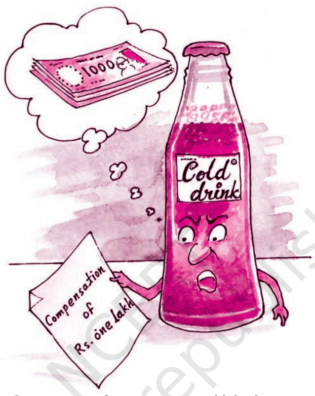
Compensation for impurities in cold drinks

themselves into consumer associations for protection and promotion of their interests. At the same time, consumer protection has a special significance for businesses too.