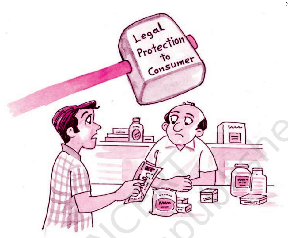
Protection against malpractices and exploitation

against defective goods, deficient services, unfair trade practices, and other forms of their exploitation. The Act provides for the setting up of a three-tier machinery, consisting of District Forums, State Commissions and the National Commission. It also provides for the formation of consumer protection councils in every District and State, and at the apex level.